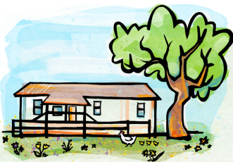
Sandy Loam Enrichment

In 2025, Sandy Loam programs will implement the following programs: