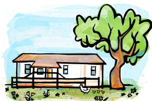
Sandy Loam Enrichment

Sandy Loam connects and engages with community members through projects and activities that focus on environmental sustainability and Sonoma County's diverse cultural heritage. The basis for this work is the Veronda-Falletti Ranch itself! Demonstration gardens and plantings are continuously worked on throughout the year.