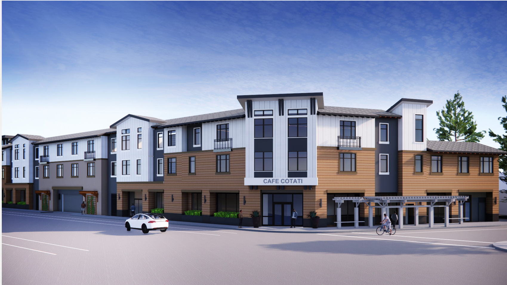
La Plaza and East Cotati Avenue, Corner View