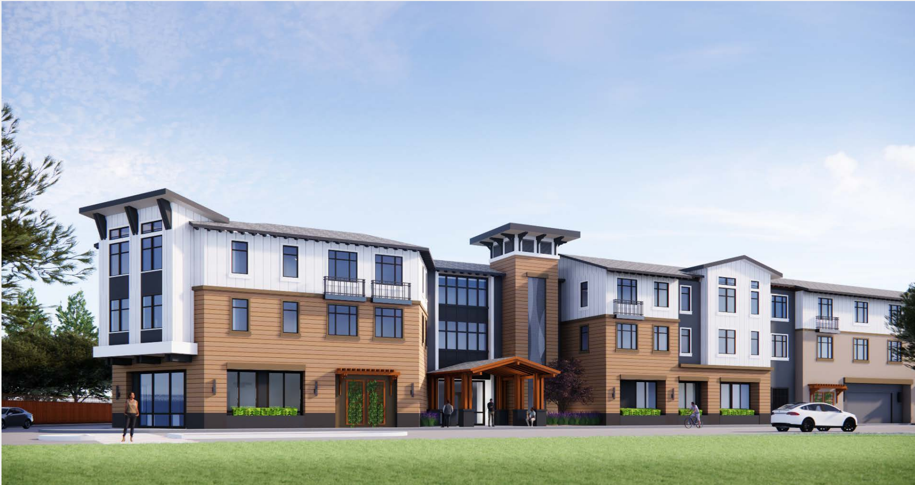
Charles Street and East Cotati Avenue, Corner View