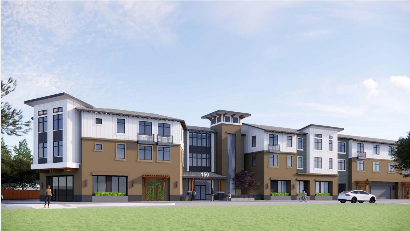
Charles Street and East Cotati Avenue, Corner View