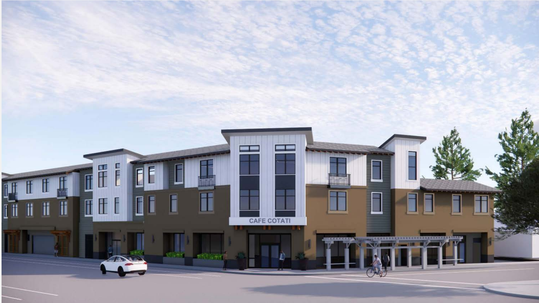
La Plaza and East Cotati Avenue, Corner View