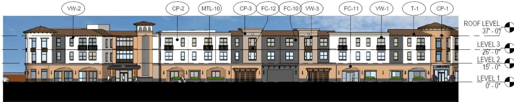
2 Cotati Avenue - Elevation 1/32" = 1'-0"