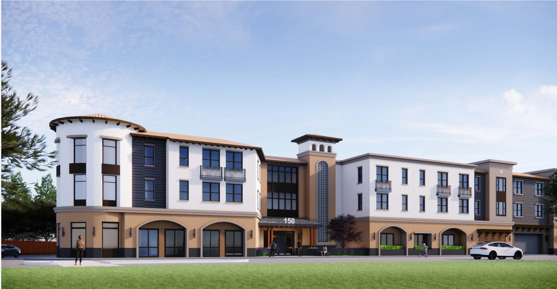
Charles Street and East Cotati Avenue, Corner View