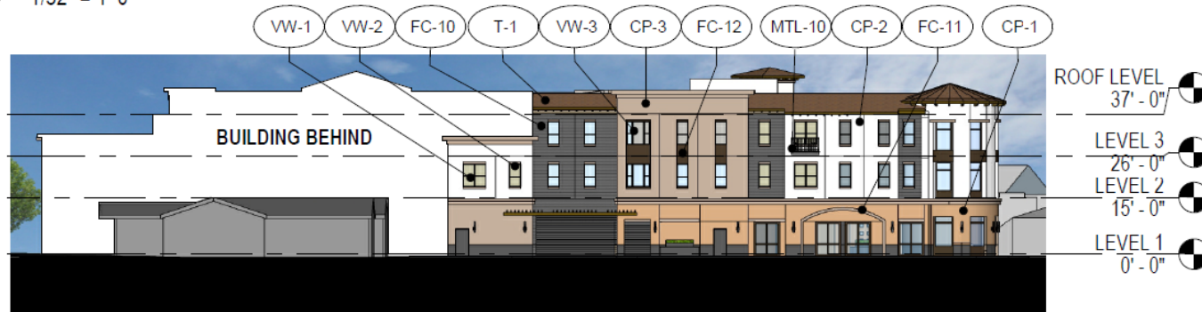
3 Charles Street - Elevation 1/32" = 1'-0"