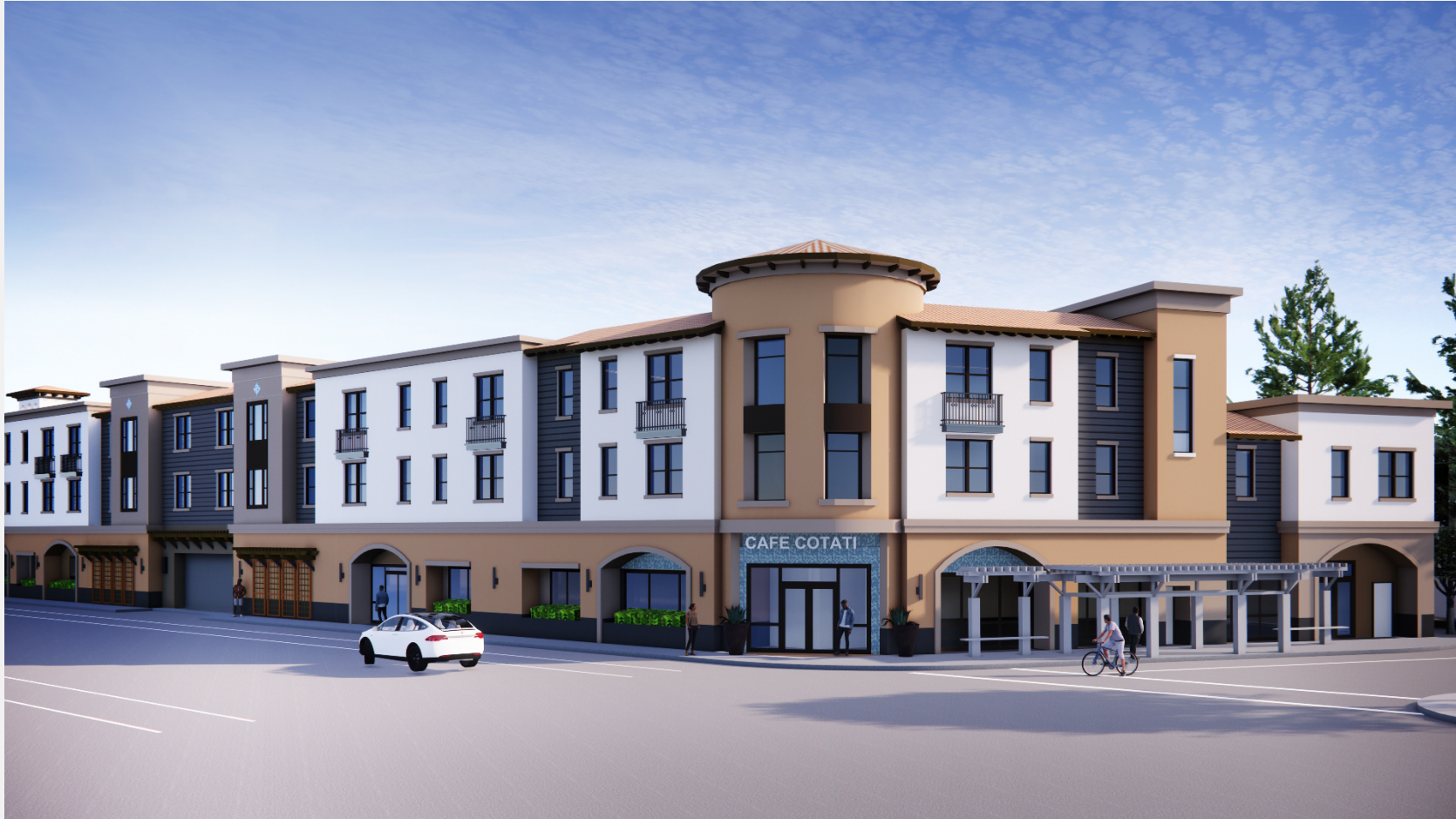
La Plaza and East Cotati Avenue, Corner View